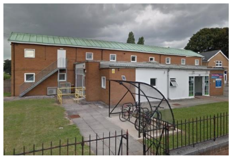
Ham Health Clinic